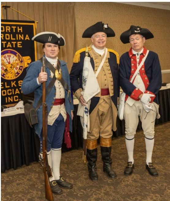
Above; Members of the SAR who presented the colors at the opening of the business meeting.