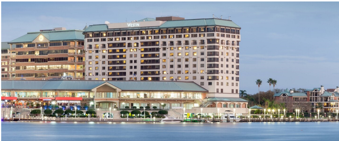
Westin Tampa Waterside