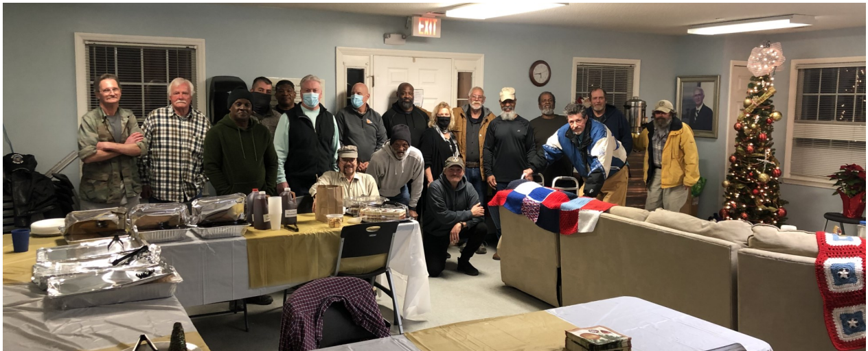
Pictured is the Holiday dinner for the Cassell Transitional Home veterans.

High Point Elks used their Beacon Grant to help two local non profits assisting Veterans. A portion of the grant was used to give a check for $2,500 to The Heroes Center, an organization helping young veterans transition to civilian life through education and mental health support. The remaining portion of the grant was used to provide a holiday dinner ($350) and financial support ($650) for veterans housed at the Cassell Transitional Home. This home provides support for homeless veterans so they are able to move into permanent housing.