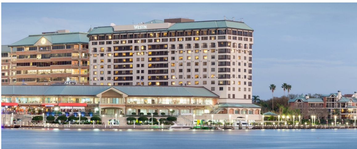
Westin Tampa Waterside