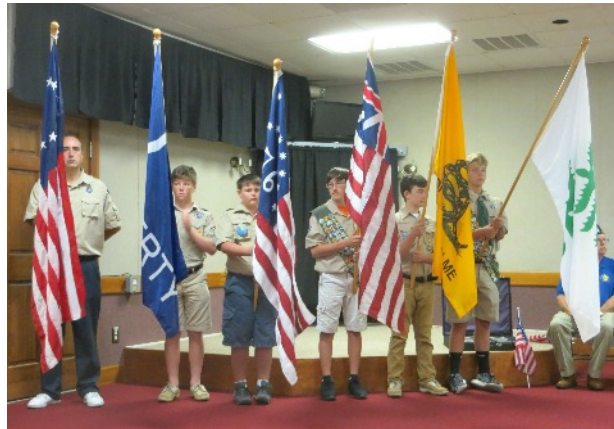
Local Scout Troop #201 presenting the Flags of our county