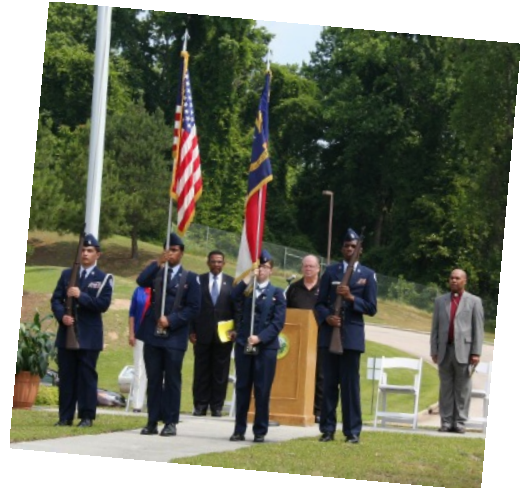
E.E. Smith High School ROTC presenting the colors.