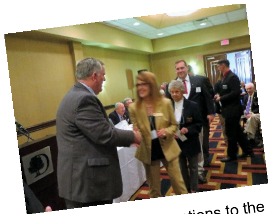
GER Hicks accepting donations to the ENF. Donations from the weekend totaled close to $5000.