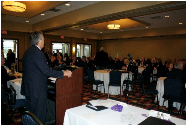
Many thanks go out to the Members of the New Bern Lodge who were wonderful hosts.