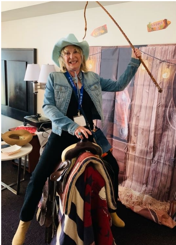
The West District hospitality room was dressed out with a Western theme.