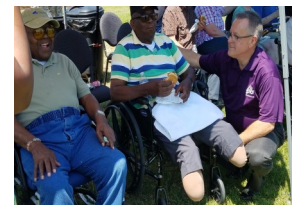
Fly-overs bring back memories