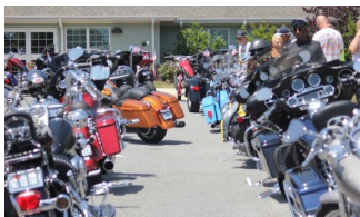
Riders arrive at the Kinston Veterans Home