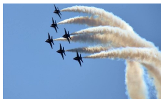
The Blue Angels—precision flying!