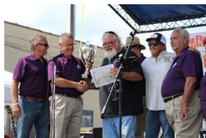
People's Choice Winner—Bikers for Christ