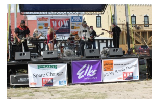
Closing band— All My Rowdy Friends