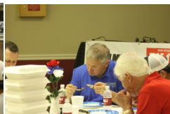
Celebrity Judges—hard at work!