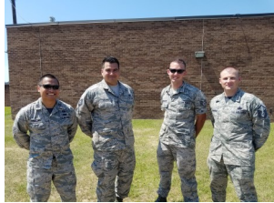
Members of the SJAFCB All-Star Volunteer Team!

The Field trip to the Wings Over Wayne Air Show took place on Friday, May 20 th and was attended by several Veterans and staff from the Kinston Veterans Home in addition to the Volunteers from the Goldsboro, Kinston and New Bern Elks Lodges.