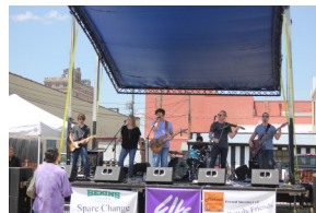
Opening band—Spare Change