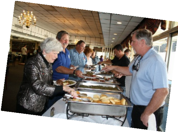
Members enjoying a Dutch lunch provided by the Greensboro Lodge