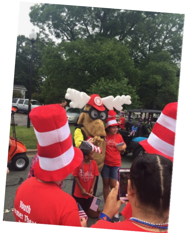
Elroy the Elk posing with local youth after the parade