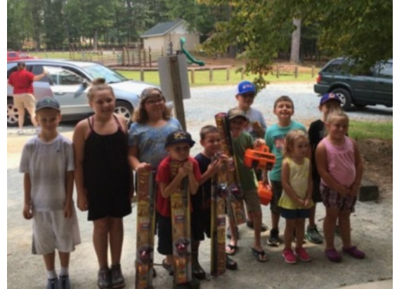
The Youth participants for the Fall Fishing Derby

The youth fishing derby also give youths a chance to go fishing who may not otherwise have the opportunity. Physiologically, fishing itself, and our programs teach balance, hand eye coordination, responsibility, courtesy, and ethics (not to needlessly harm fish or litter). The Roxboro Elks Lodge would like to thank the Person County Parks and Recreation Department and look forward to continuing future partnerships in an effort to make our community a better place.