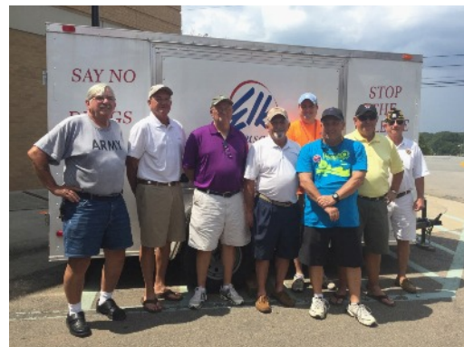
Members of Roxboro Lodge #2005 that participated in the Elks Drug Awareness Campaign at the 37 th Personality Festival.