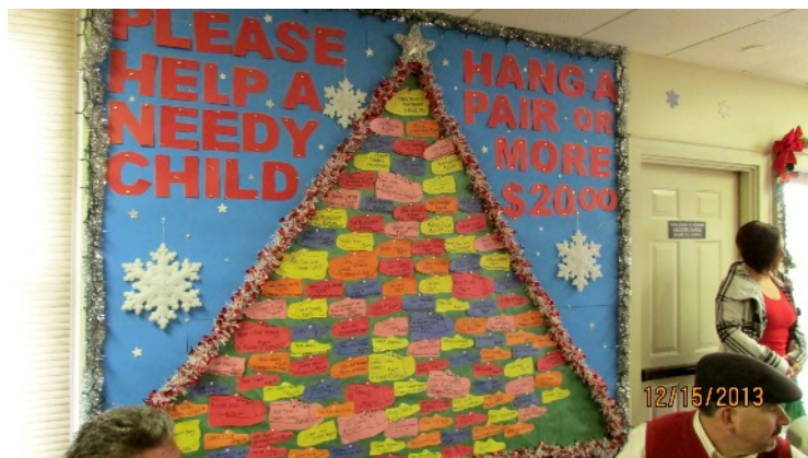
2013 CHILDREN'S HOLIDAY SHOE PARTY ASHEVILLE LODGE #608

This year, they are sponsoring approximately 350 children. This also includes many siblings of the school aged children involved. During the children's time at the Lodge, they will enjoy a variety of holiday excitement. They begin with a favorite Christmas movie along with hot chocolate and cookies while patiently awaiting their turn to participate in the afternoon festivities. All children will receive a new pair of shoes, socks, fruit, candy, crayons, coloring books, pencils, notebook paper, a toy of their choice, as well as a few additional surprises this year. The children will also have a chance to visit with Santa Claus, Mrs. Claus, and many of the Elves.