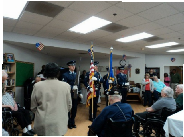
Air Force Color Guard at the NC Veterans Home in Fayetteville