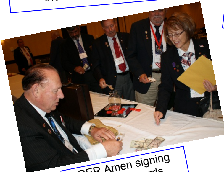
GER Amen signing members cards