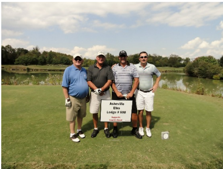
2014 COACHES QUEST FUNDRAISER ASHEVILLE LODGE #608