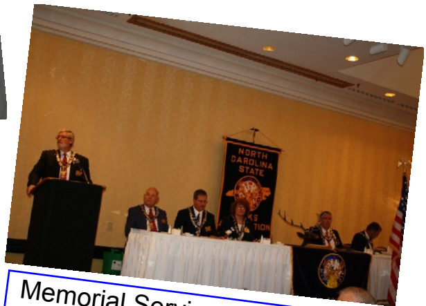
Memorial Service performed by Salisbury Lodge #699