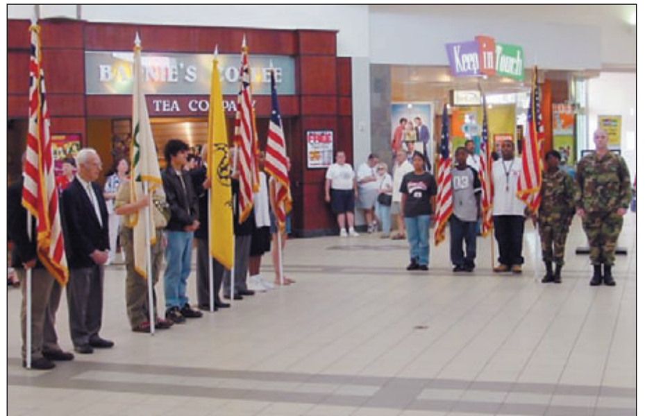
Durham Lodge #568 observed and honored Flag Day with a brief ceremony about the history of our flag at Northgate Shopping Mall. The Honor Guard was made up of Elks, Boy Scouts, and members of Hillside High School Army ROTC and the NC National Guard. During and after the ceremony, Elks members handed out 1,000 small flags.