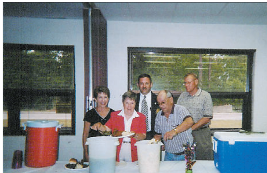
Fayetteville Lodge #1081 Elks serving dinner to veterans and families of National Guard soldiers returning from Afghanistan.